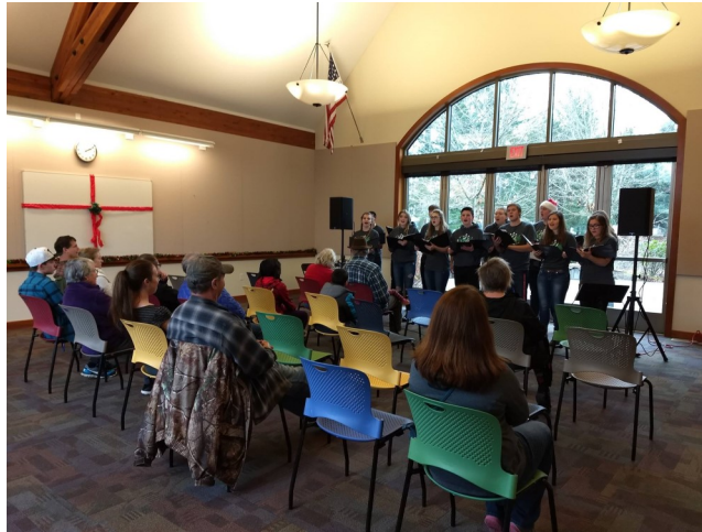
The Estacada High School Troubadours got the party started at Cider in the Stacks, Dec. 16