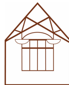
Friends of the Estacada Public Library

Footnotes is a publication of the Friends of the Estacada Public Library Board