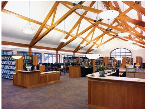
Early image of Library interior

The CM/GC method was selected for this project for a number of reasons. Firstly, this method was chosen in order to retain, during the design, experienced construction estimating personnel for the Library, since we are working with such a tight budget on a fairly complex building, and the cost of construction has been escalating in recent months. Secondly, we wanted to phase the design to efficiently perform the work (similar to a "fast-track" approach), to minimize both the cost escalation and costs for wet weather construction. Total project time is thus reduced. Lastly, early involvement of the CM/GC firm helps build a collaborative relationship between the designer, owner, and the contractor. The construction of the new Clackamas River Elementary School and the remodel to the Junior High School in 2002 successfully utilized this approach.